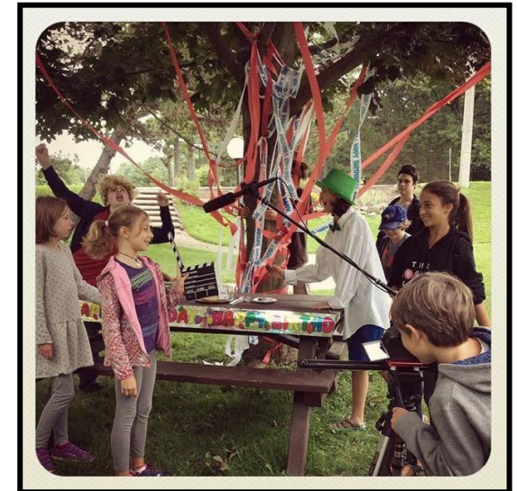
image, film camp 2015

Film Camp: In this hands-on film production program, we will explore different cinematic genres creating our own film sequence inspired by various styles, directors and ideas. Learn how to story-board and shoot collaborative ideas while trying your hand at writing, directing, production design, cinematography, sound, lighting and even acting! Finally, screen your film with friends & family from our exclusive (private) YouTube channel.